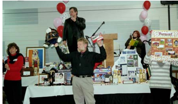
Live auction excitement!!

The beautifully displayed art, accompanied by the artist’s biography and photo, immediately attracted guests and pieces were selected and spoken for quickly. Shortly after the doors opened, people inspected the auction tables and the crowd kicked into high gear as bidding become increasing spirited. The live auction was the highlight of the evening. Guests vied