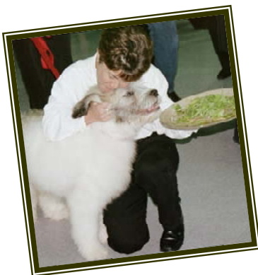
Furry Guest at Paws for Love 2007

Love items are one-a-kind treasures, useful animal-related items, and opportunities to enjoy some of California’s best food, wine and relaxation spots. We need your help to guarantee there is something for everyone at Paws for Love. And Volunteers are the heart of the event and cannot happen without them. Please think about how you can help make Paws for Love a continued success in 2008. With exciting changes in the works, Paws for Love expands ways to reach out and help more and more animals needing our support. We look forward to having you join us in our efforts!